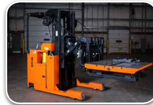
Stand Up Rider Reach