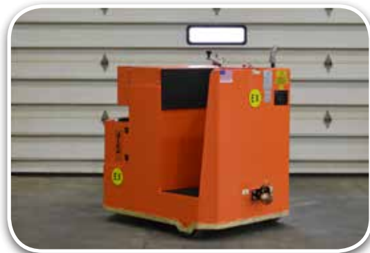
Standup Rider EX Pull Tractor