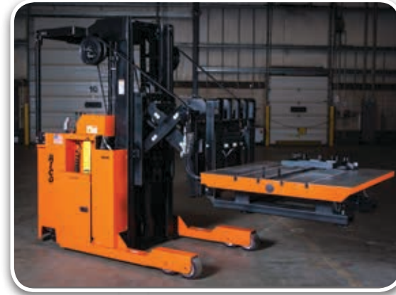
Stand Up Rider Reach

The RICO reach and straddle truck series is ideal for narrow aisle operations. Our design features higher load capacity capabilities, rugged construction, and compact design for superior performance and operator comfort.