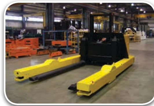
AGV Automated Guided Vehicle