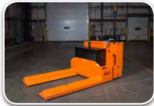
Four Directional GDC Cart