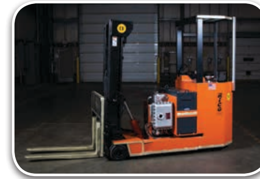
Stand Up Rider EX Counterbalance