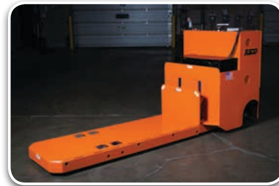
Rider Platform Low Lift

RICO's platform truck series are designed to improve load handling and load stability. These trucks increase efficiency when lifting and transporting heavy and awkward loads throughout manufacturing or destination facilities.