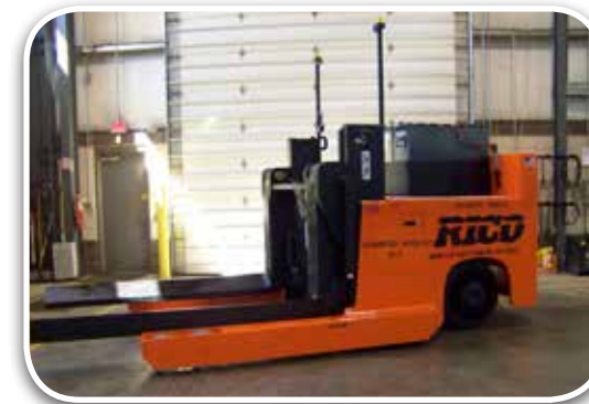
Remote Controlled Straddle