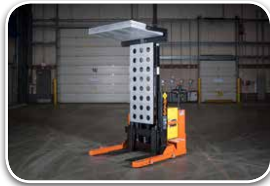
Walk Behind Straddle