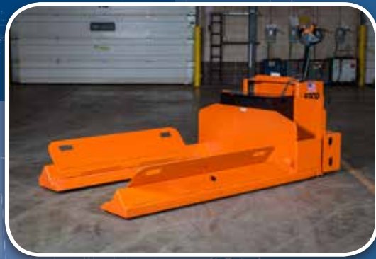
10,000 lbs. Capacity Walkie Roll Handler