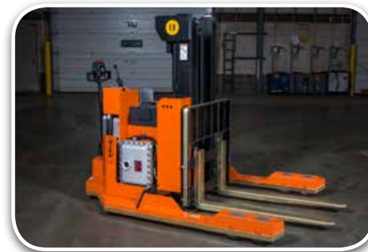
Walk Behind EX Straddle