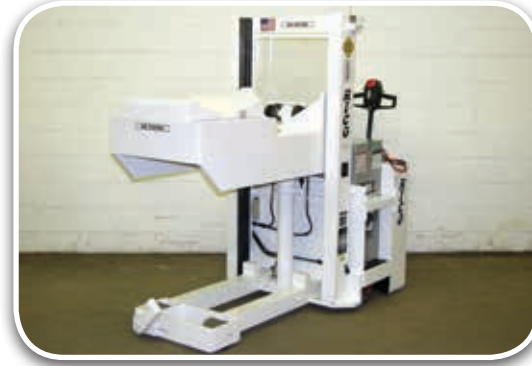
High Lift Platform with Cradle