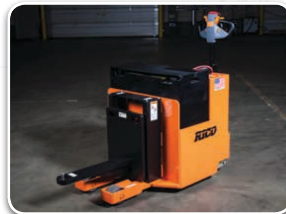
Walk Behind Lift Tow