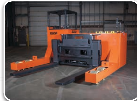
Sit Down Rider Straddle

Our heavy duty reach mechanisms offer a single or double action reach extension and are constructed of high-strength steel plate for unmatched performance and maintenance free operation. RICO's reach mechanisms are designed with tilt, fork positioning, and side shift operation. They offer limitless front end attachment options that are specifically cater to your application. Each vehicle is designed with our clear view mast and low profile outrigger, increasing load to truck clearance, and increased visibility for damage free operation.