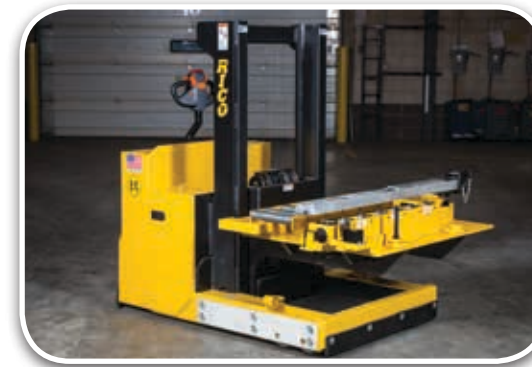
Walk Behind Compact Die Cart