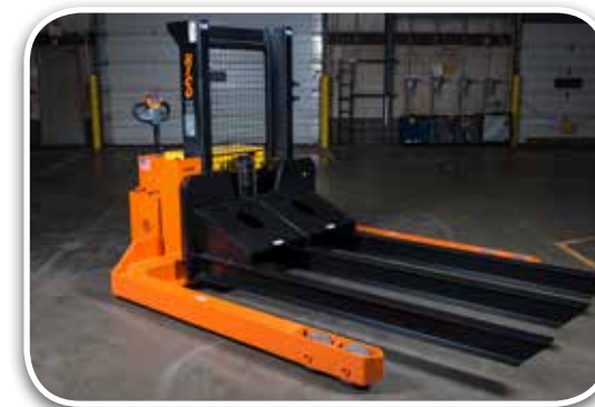
Walk Behind Straddle