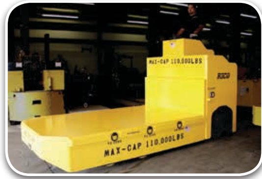
Stand Up Rider Transporter