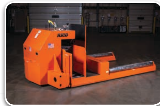
Rider Power Roll Handler

RICO's roll and coil handlers were specifically designed for the paper and steel industry to lift and transport rolls throughout facilities with ease. These heavy duty trucks have specially designed forks and rams to take on the stress of high capacity loads of various lengths and diameters.