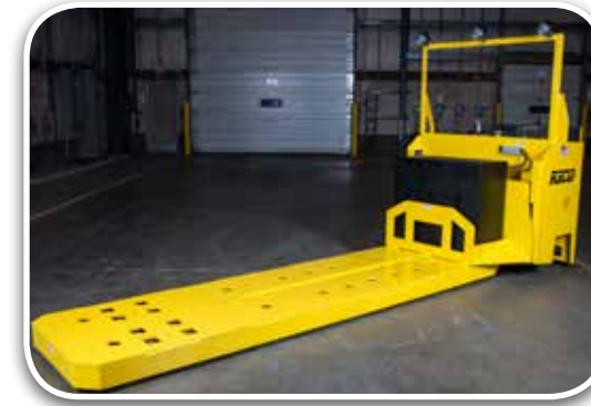
Stand Up Rider Platform