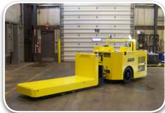
Remote Controlled Platform