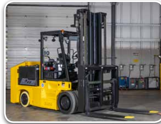
Pegasus AC Electric

PEGASUS has been ergonomically designed for operators and service technicians alike. Visibility has been maximized to improve operation by utilizing our cab forward and higher operator seat design - providing comfort, safety and convenience - the PEGASUS is truly one of a kind.