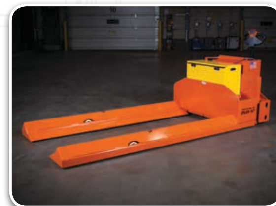
Walk Behind Roll Handler

Roll handlers are designed with contoured forks to handle rolls of varying diameters and offer roll adapter flaps as an option for a wider range of use. These adaptors are designed in either lightweight aluminum or steel for added strength. This allows one truck to be utilized for a variety of load diameters and widths.