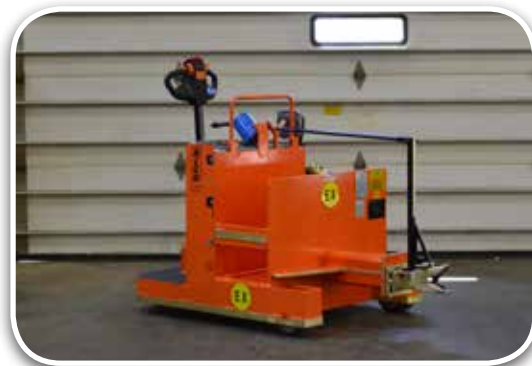
Walkie EX Pull Tow