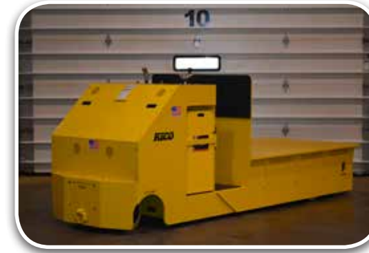
Stand Up Rider Transporters