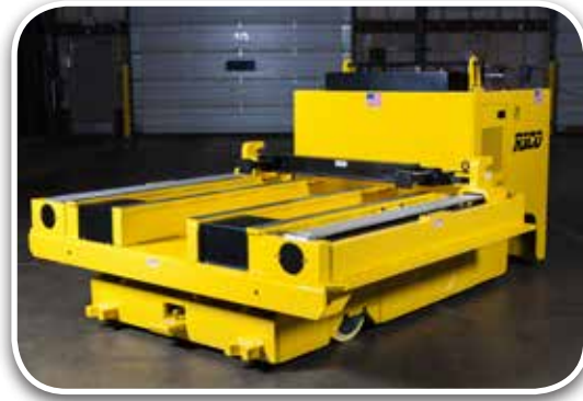
Stand Up Rider Die Handler