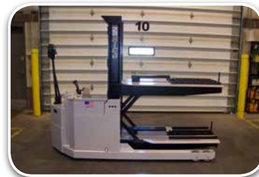
Walk Behind Two Tier Die Cart