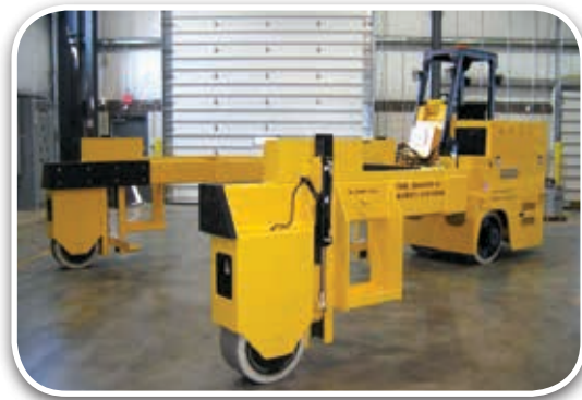
Space Shuttle Custom Straddle