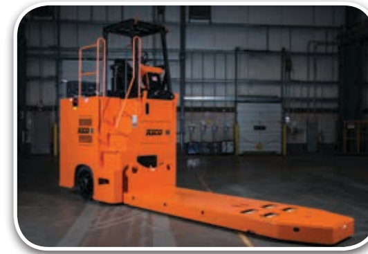
Sit Down Rider IC Platform