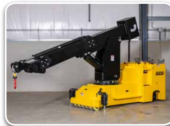
Heavy Duty Rider Crane Truck