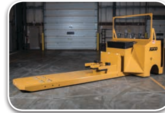
Stand Up Rider Platform