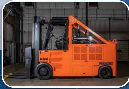
62,000 lbs. Capacity Diesel Counterbalance