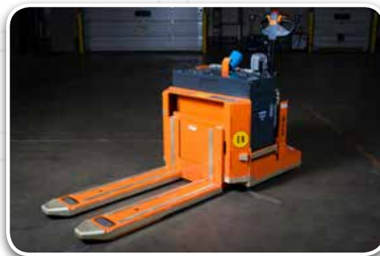
EX Pallet Truck