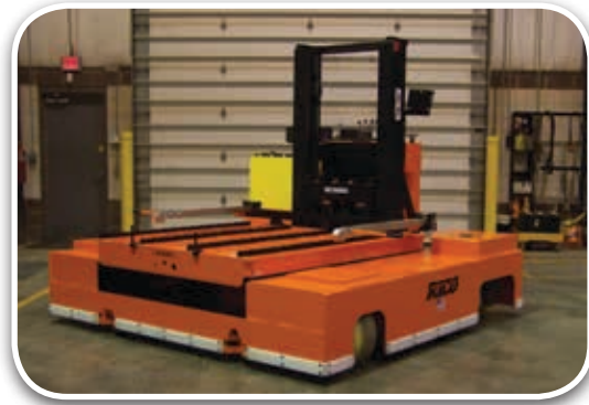
Four Directional GDC Cart