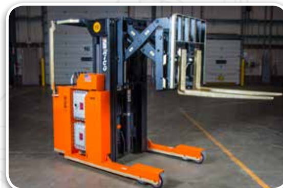
EX Rider Reach