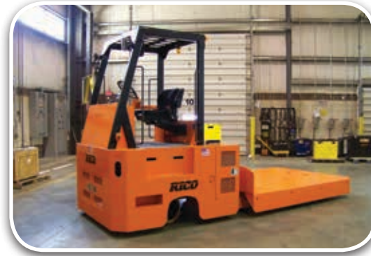
Sit Down Rider Platform