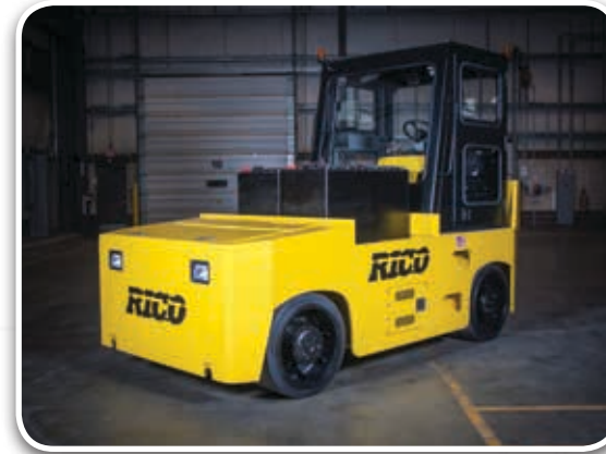
Sit Down Rider Tractor