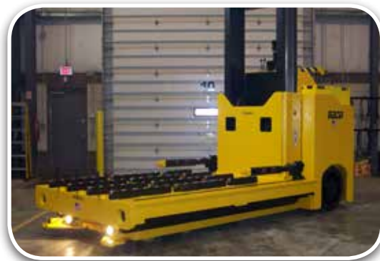
Rider Die Handler