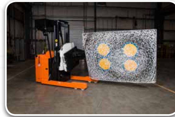
Stand Up Rider Straddle

Automatic Guided Vehicles (AGVs) are also available.