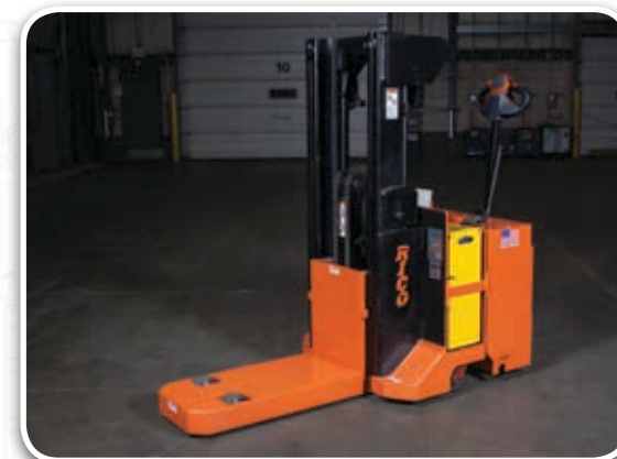
Walk Behind Platform Highlift

We take more into account than just the size of the platform for support. Our heavy duty platform under carriage is designed with hinge style lift for maximum load capacity and increased platform stability. Pallet style lift is utilized for high capacity loads and lower platform height applications. Our high lift mast can be used for increased lift height requirements. Each style delivers exceptional load stability and safe transportation of materials.