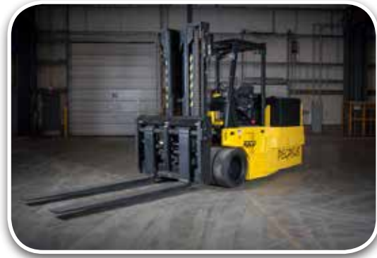
Sit Down Counterbalance