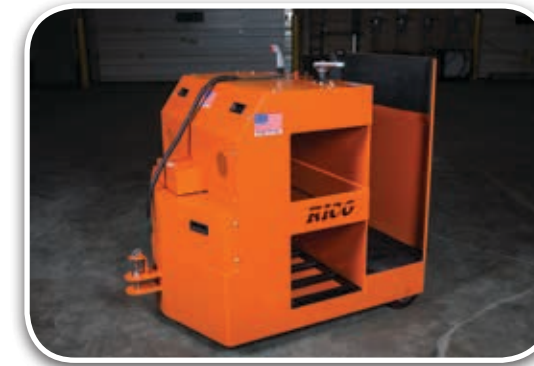
Stand Up Rider Tractor