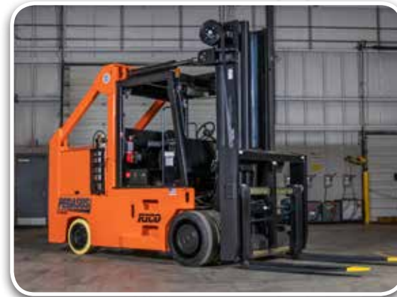
Pegasus LP Gas