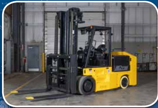
40,000 lbs. Capacity AC Electric Counterbalance