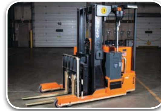
Stand Up Rider EX Reach