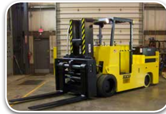
Stand Up Rider Counterbalance