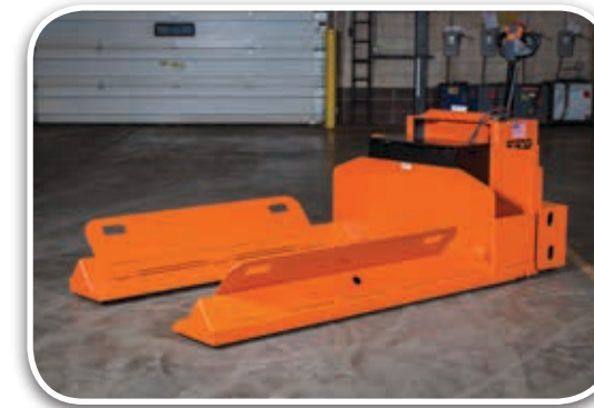
Walk Behind Roll Handler