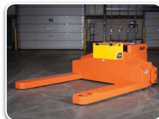
Walk Behind Pallet Truck