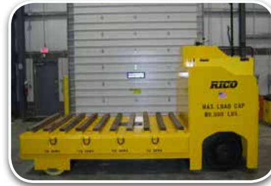
Stand Up Rider Transporter