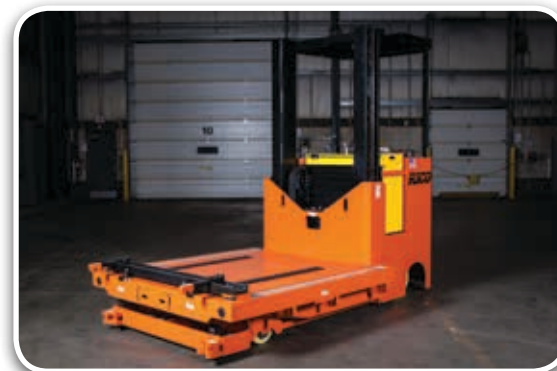
Rider QDC Cart