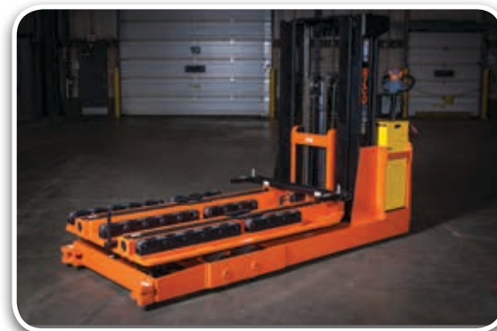
Walk Behind QDC Cart