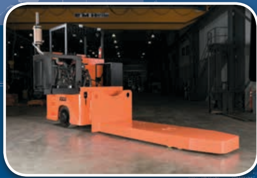
80,000 lb. Capacity Diesel Rider Platform