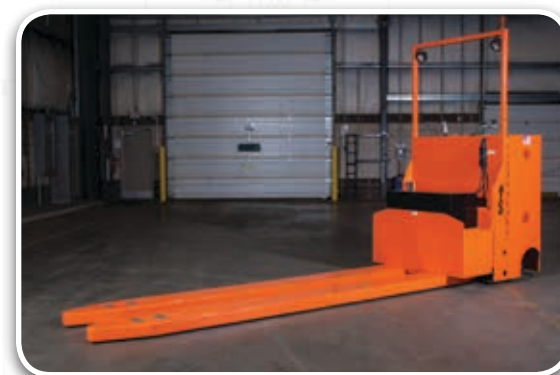
Rider Pallet Truck